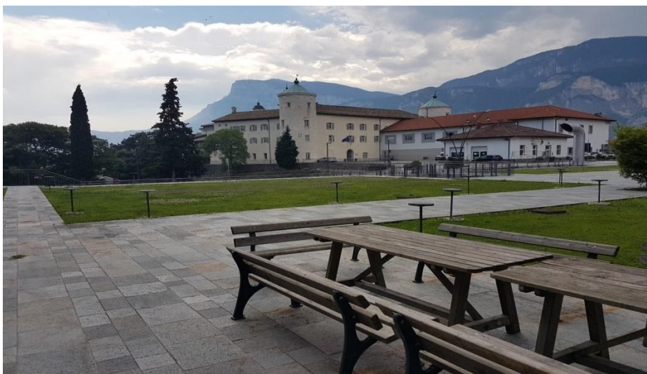
The tiled garden (it is a rough job, but someone has to do it)